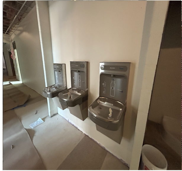
Water fountain install is complete