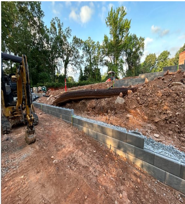
Begin Modular wall work