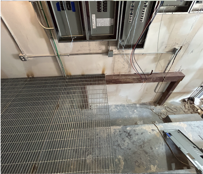
Installing balcony grates